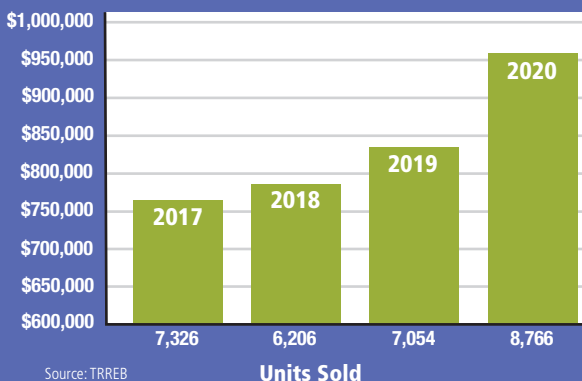
Average Home Prices - November in the Greater Toronto Area